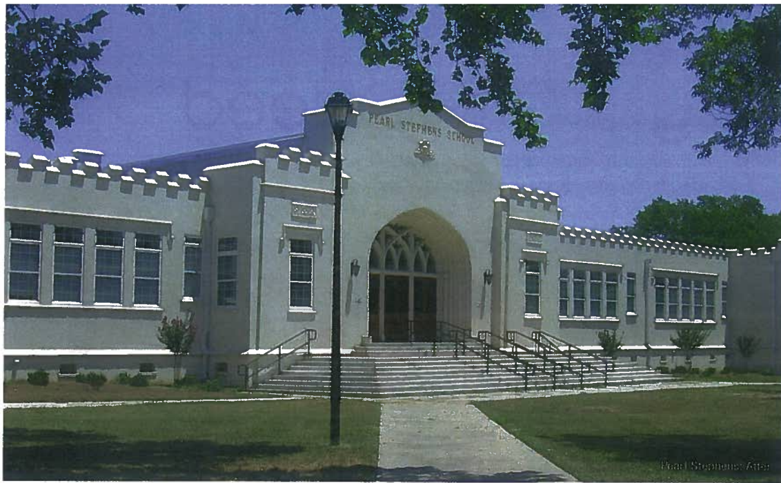
Pearl Stephens After